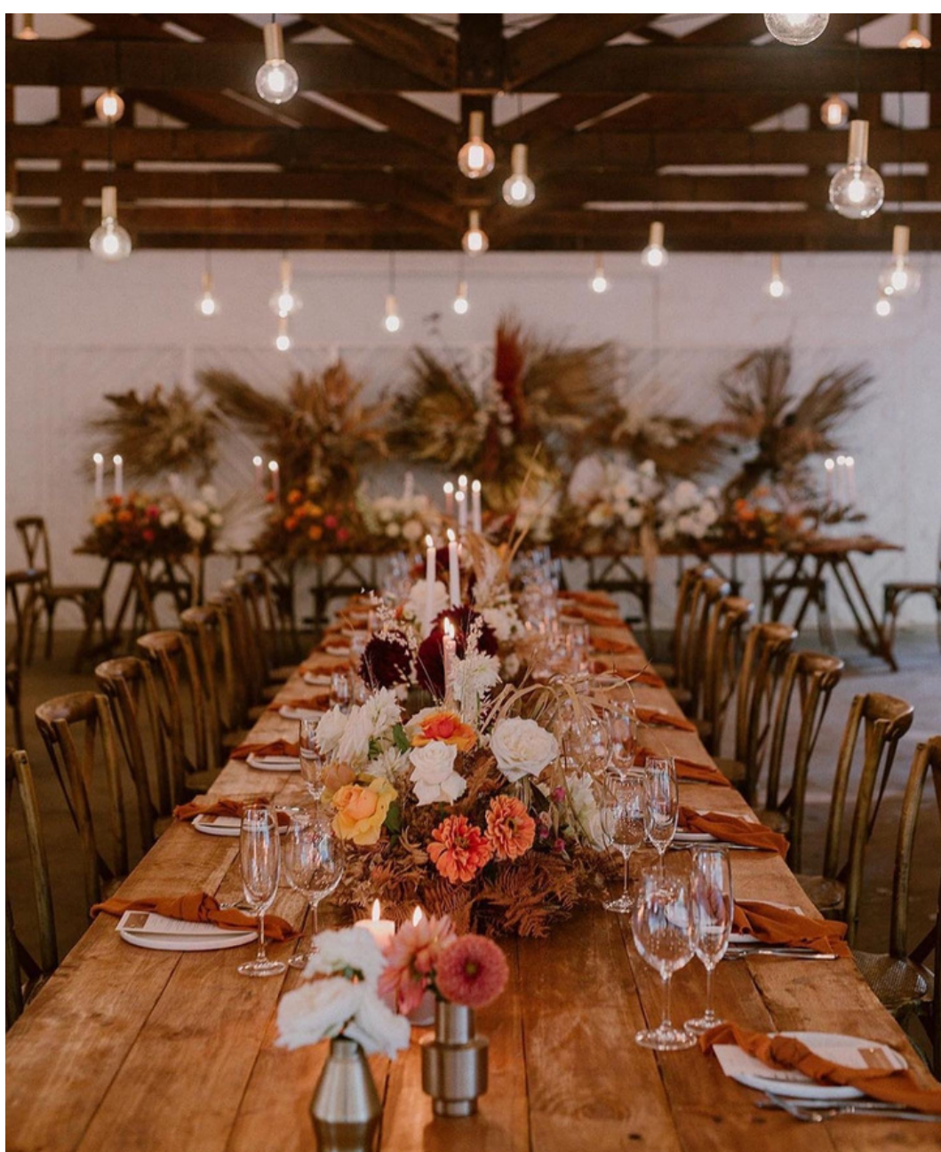
Reception area inside the indoor venue area, with partition wall.