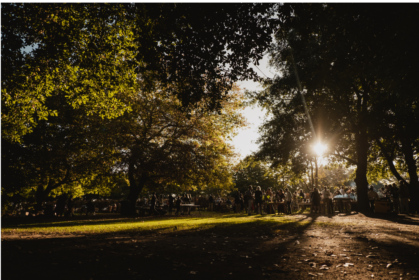
Pre-drinks on the Table Restaurant Lawn