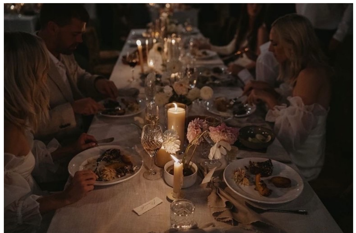
Reception outside in the garden.